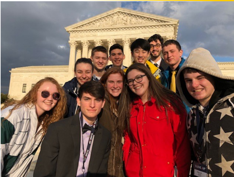
2018 IHS Group in front of the U.S. Supreme Court 2017 Close Up Group in front of the U.S. Capitol